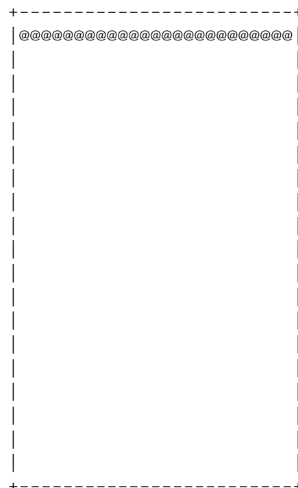
FIGURE 1- Correct transparency orientation